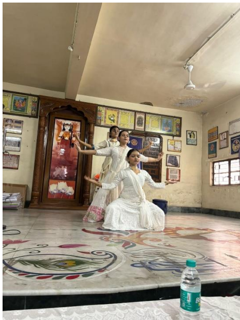
Dance performance by Students