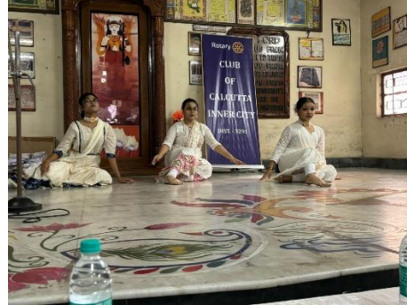
Dance performance by Students