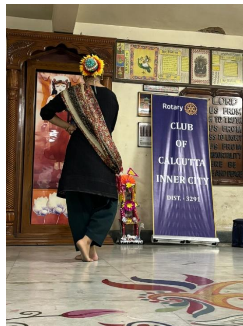
Dance performance by Students