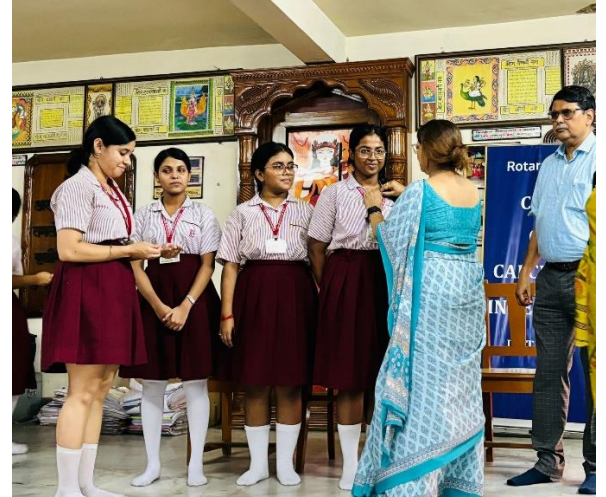
Pinning of Office bearers